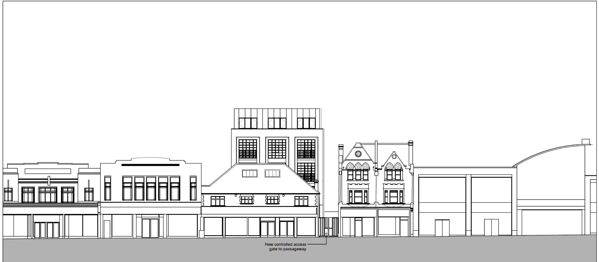
Section A-A (Front Elevation)